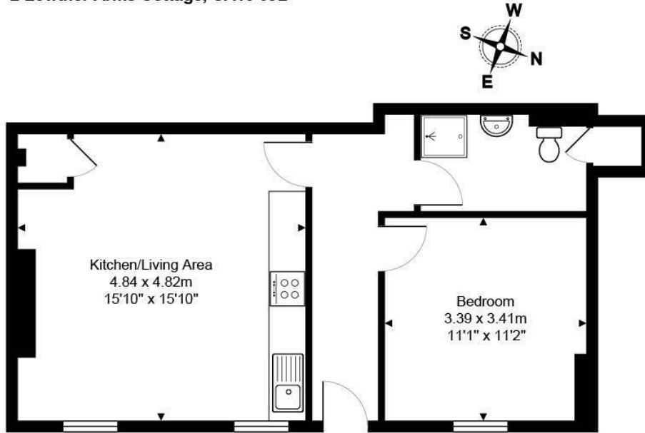
2 Lowther Arms Cottage, CA13 0JB

All measurements are approximate and for display purposes only